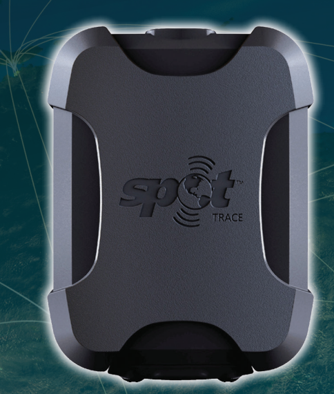
Pictured at Actual Size. 6.8cm x 5.1cm

Satellite technology tracks beyond the reach of normal mobile network coverage