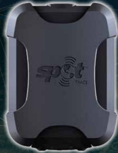
Pictured at Actual Size. 6.8cm x 5.1cm